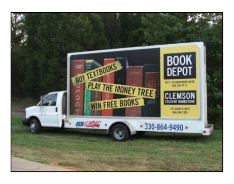
Figure 6.2: Vehicle being used for signage