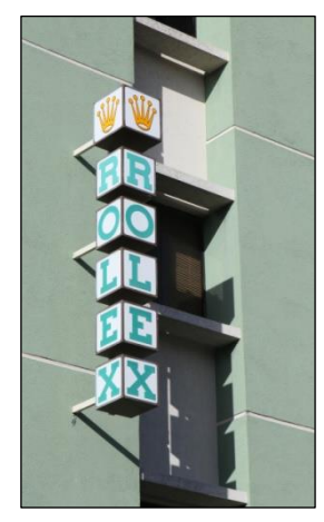
Figure 5.3: Example of a Projecting Sign