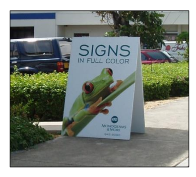
Figure 6.1: Temporary Sign blocking sidewalk