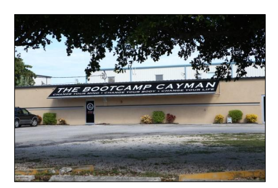
Figure 5.2: Examples of Canopy Signs