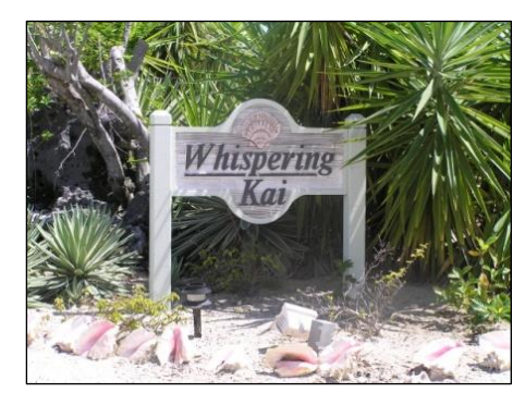
Figure 5.1: Example of a home identifier sign.

Allowable signs include, but are not limited to: address signs, home identifier signs, home occupation signs. Signs may be freestanding (no higher than 3 feet), mounted to a permanent structure or displayed in a window.